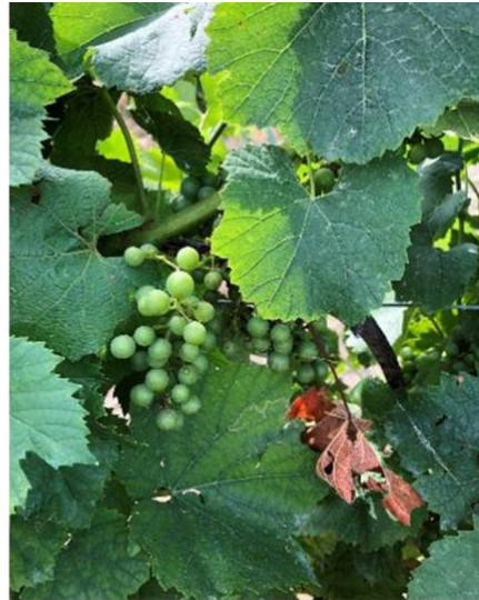
55 days after trial initiation